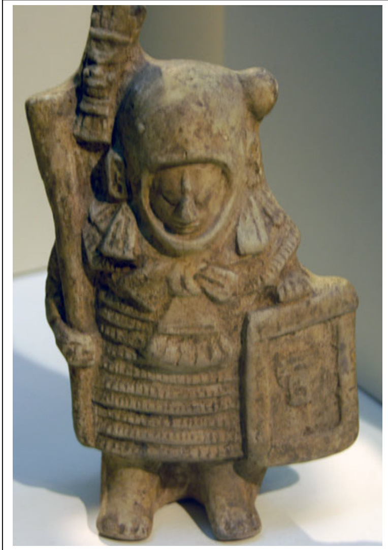
A warrior figurine at the Popul Vuh Museum in Guatemala City dated 900 A.D. to 1200 A.D.

“...Moroni, had prepared his people with arm-shields, and also shields to defend their heads, and also they were dressed with thick clothing ” ( Alma 43: 19 )