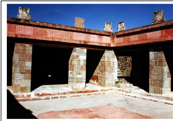
The Palace of Quetzalpapalatl